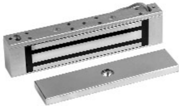
8375 Surface mount for small enclosures